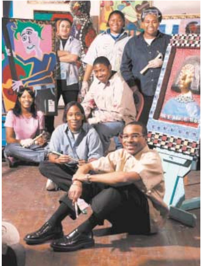
Dayton area high school students in the Artist-In-Training Program.

A grant from the Mathile Family Foundation helps K12 provide after-school employment for high school students through its Artist-In-Training program.